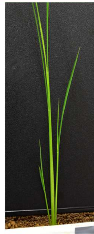
Genome editing rice